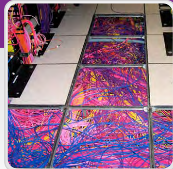
This was cabling infrastructure that was in place before Triad arrived.